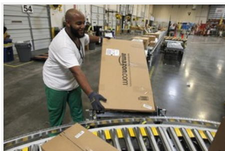
An employee lifts a box at an Amazon.com fulfillment center, in Goodyear, Arizona. Amazon plans to open a center in Dinwiddie and in Chesterfield.

Central Virginia welcomes Amazon.com to the neighborhood. The e-tailer's decision to open major distribution centers in Dinwiddie and Chesterfield ranks among the most encouraging news stories in the past year. The two centers will employ about 1,350 people.